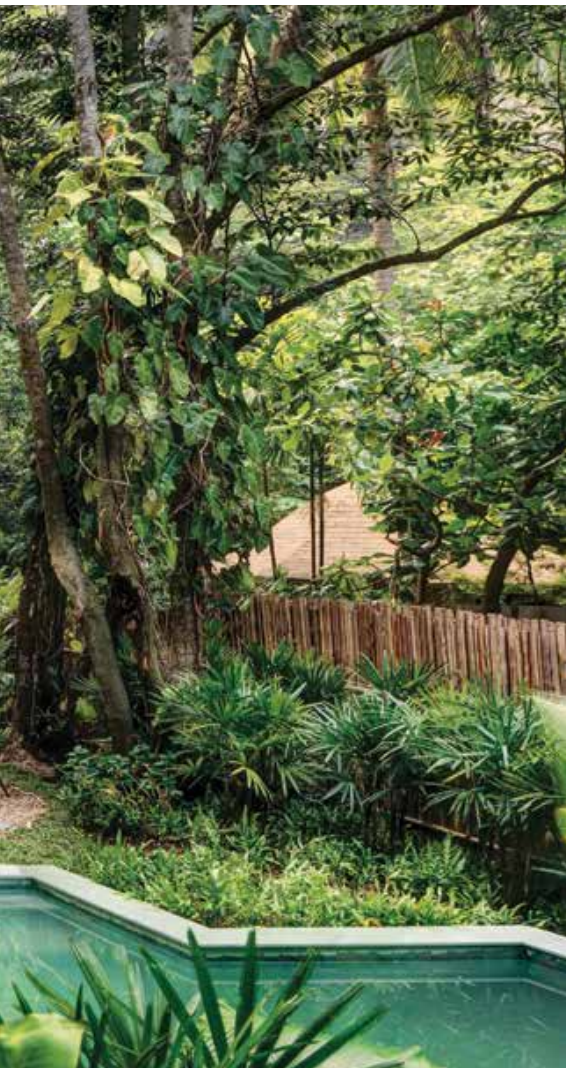
OPENING PAGE: Serenity at Phulay Bay Resort, Krabi. THIS PAGE: Eclectic setting at Dusit Thani. OPPOSITE PAGE: Krabi Beach Resort Centara Grand Beach Resort & Villa boasts exceptional views; two-storey pavillion at Rayavadee Krabi

Located right in the heart of the resort, ready to take care of you from head to toe is Spa Cenvaree – a refuge of well-being and relaxation. Cenvaree offers a place to rejuvenate in one of seven treatment suites as well as two new honeymoon suites. Celebrating Thailand’s wellness heritage, there is an extensive selection of massages, holistic therapies and healing rituals, passed down the generations. Choose from more than 50 therapies, including Ayurvedic programmes, spa journeys for couples and facial and body massages that use locally-grown herbs. The signature treatment, the Ultimate Wellbeing, covers three hours and is inspired by village rituals of deep cleansing after a long day in the field, using earth stones to increase strength and vitality.