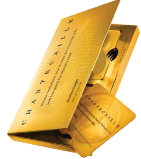
Chantecaille's Gold Energizing Eye Recovery Mask

Eye treatments often come with a revitalising facial in spas. At eforea: spa at Hilton Queenstown at Hilton Queenstown Resort & Spa, the signature Correcting Facial