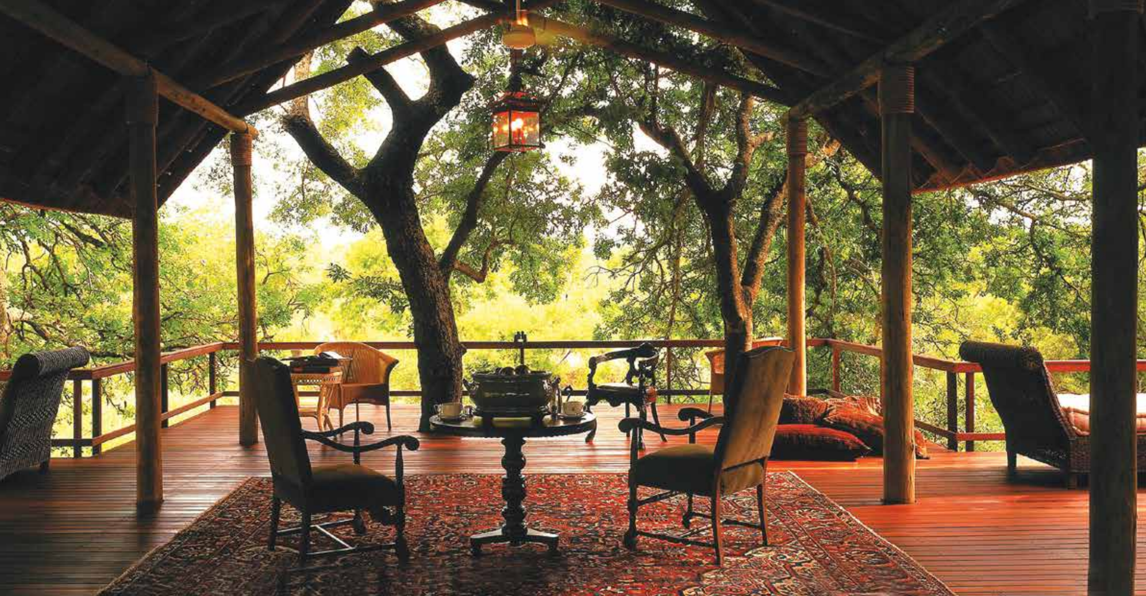
THIS PAGE: Grand architecture at The Oberoi Rajvilas. OPPOSITE PAGE: Hidden amid nature, the opulent Royal Malewane; the decadent interior design of The Oberoi Rajvilas in Jaipur

Sprawled across 1.3 km of pristine private beach, surrounded by lush manicured gardens and 114 gold domes, including the Grand Atrium (which is higher than the dome of St Peter's Basilica in Rome) this hotel, dubbed 'seven stars', takes luxury to a new level.