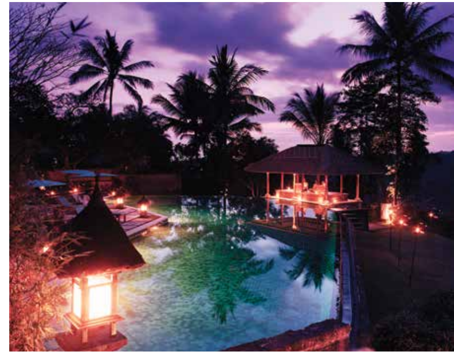
THIS PAGE: The sun sets over the sumptuous Amandari in Bali; Lizard Island's stunningly clear waters and white sand beaches. OPPOSITE PAGE: Romance and dining with a view at Emirates Palace. OPENING PAGE: Poolside luxury at Hotel Le Toiny St Barth

For something more energetic, hike to Cook's Lookout – 1,200 feet up, the views are simply breathtaking. This is a little piece of paradise on earth, where you're limited only by your imagination. www.lizardisland.com.au