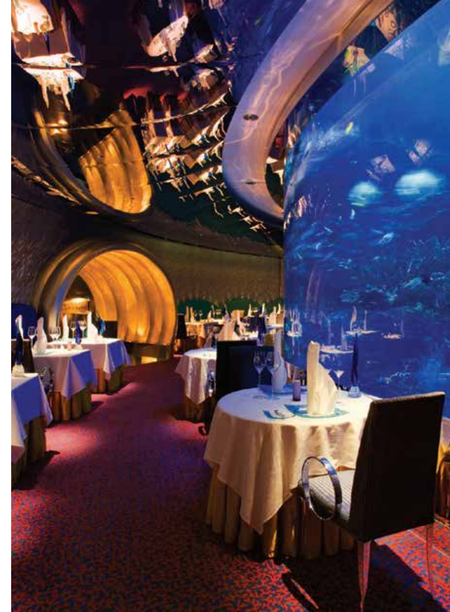
THIS PAGE: Dining at Burj Al Arab's Al Mahara restaurant. OPPOSITE PAGE: Magnificent views from the private pool at The Wakaya Club & Spa in Fiji